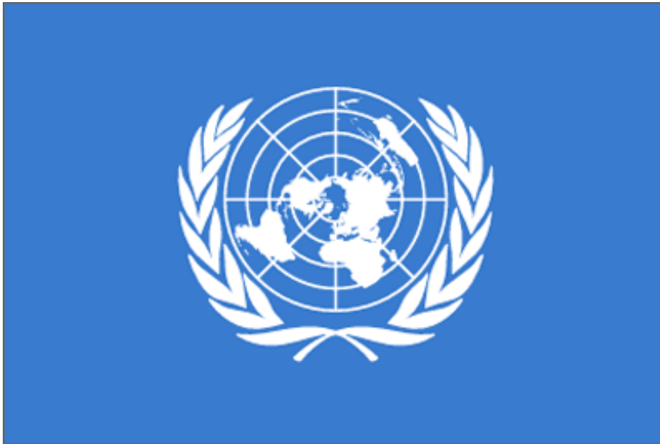
Figure 2. Flag of the early (US-dominated) First Terran Federation, from early 1974 to 2057 (AE 31 to AE 114).

North America, and probably stays there until “the debacle in the United States in A. E. 114”. 25 The old UN emblem is therefore the emblem of the First Terran Federation from AE 31 to 114. (Figure 2.)