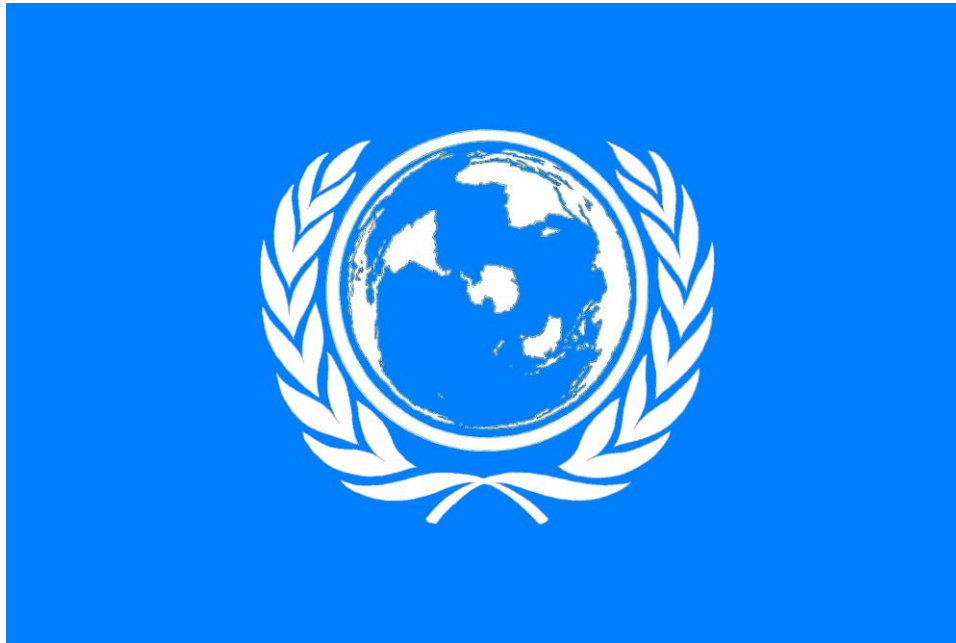
Figure 3. Proposed flag of the later (Southern-dominated) First Terran Federation, from circa AE 115 to 183 (2057 to 2126 AD).

While drawing the emblem, one change I decided upon is the removal of all lines pertaining to latitude and longitude. 42 Though important to determine location, these can be viewed as lines of geographic division, which, like national borders, separate the world into different regions. In making one nation out of all Terro-Humanity, the post-WWIV Federation would probably be at pains to emphasize unity.