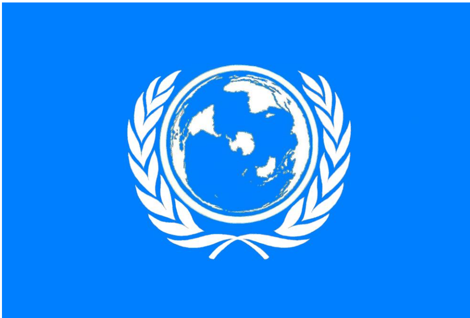
Figure 5. Proposed flag of the Second Terran Federation, from AE 183 to circa 1097 (2126 to 3040 AD).

After the Secession of Venus, the wreathed globe remains the symbol of a united Second Federation for many centuries, from AE 183 to 839. During this extended period of peace, prosperity, and expansion, the noontide of Federation glory, hundreds of planets are colonized and grow into Member Republics under the wreathed globe banner. But eventually, serious political divisions reappear, leading to another secession, that of the System States, resulting in the System States War.